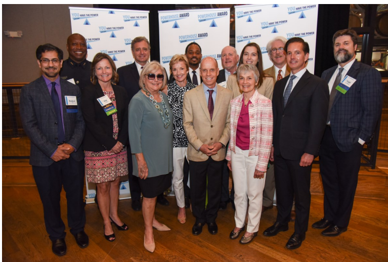
At the 2019 Powerhouse Awards, honoree Scott Hamilton (center) joins YHTP's Board of Directors for a group photo.

This position is ideal for high school and college students seeking community service hours, as well as anyone else seeking experience in event planning or the non-profit field.