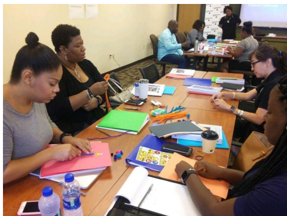
Participants in a facilitator training session for YHTP's Youth Impact Curriculum explore one of the hands-on exercises included in the course.

For “Skills and Qualifications” and “Benefits”, refer to the “Volunteer Program Facilitator” section on the opposite page.